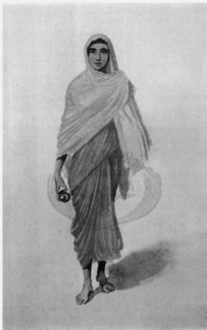
A WIDOW IN THE DECCAN